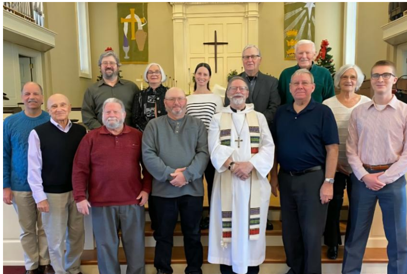
2026 Council Members

Next Meeting is Thursday February 12th at 6:30 pm. We adjourned the meeting with the Lord's Prayer.