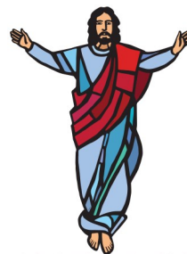
He ascended INTO Heaven