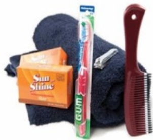
Personal Care Kits