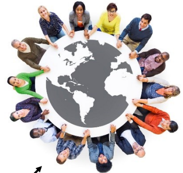
ELCA Mission Support