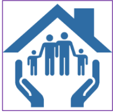
Area Unhoused Mission